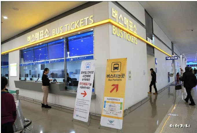
Bus Ticket Counter of Terminal 2 (Incheon airport)

B. The fastest way would be to use KTX (express train). It takes about 3.5 to 4 hours from Incheon International Airport to Pohang. You should first take a limousine bus at the airport to GwangMyeong Station and then take KTX (express train) to Pohang Station. At Pohang Station, we recommend you to use a taxi. The direction is shown in the next page. The details of the airport can be found at https://www.airport.kr/ap/en/index.do . For public transportations at the airport, please visit https://www.airport.kr/ap_cnt/en/tpt/pblcpt/pblcpt.do .