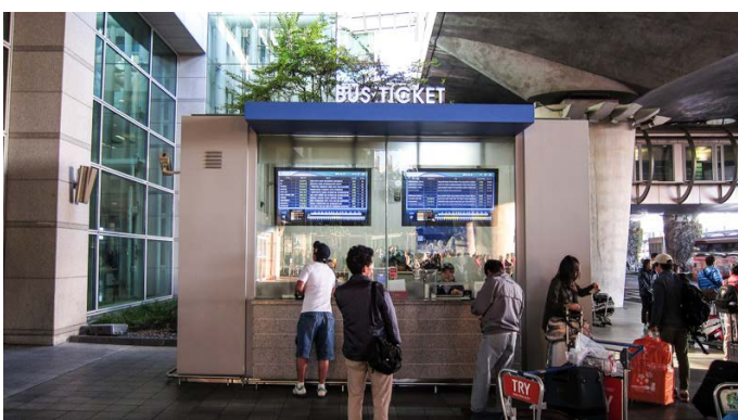
Bus Ticket Counter of Terminal 1 (Incheon airport)